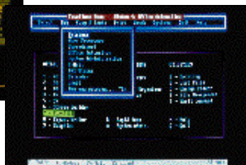
...PCs with terminal emulation.

"The folks at FacetCorp have achieved sainthood with FacetTerm 3.0. This product makes character terminals far more useful than they were ever meant to be." UNIX Review